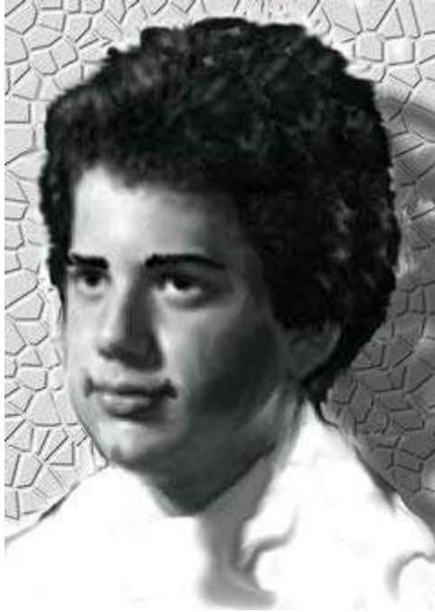
John Mark the Apostle