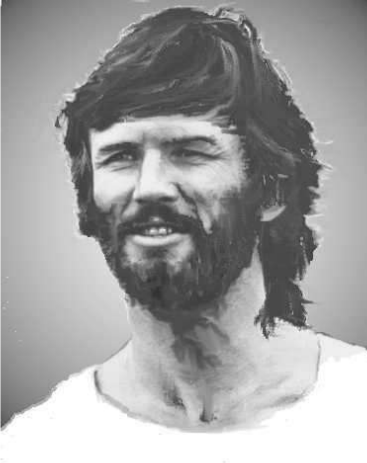
Judas of Keriioth