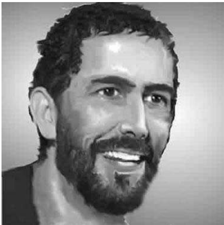
Joseph, father of Jesus