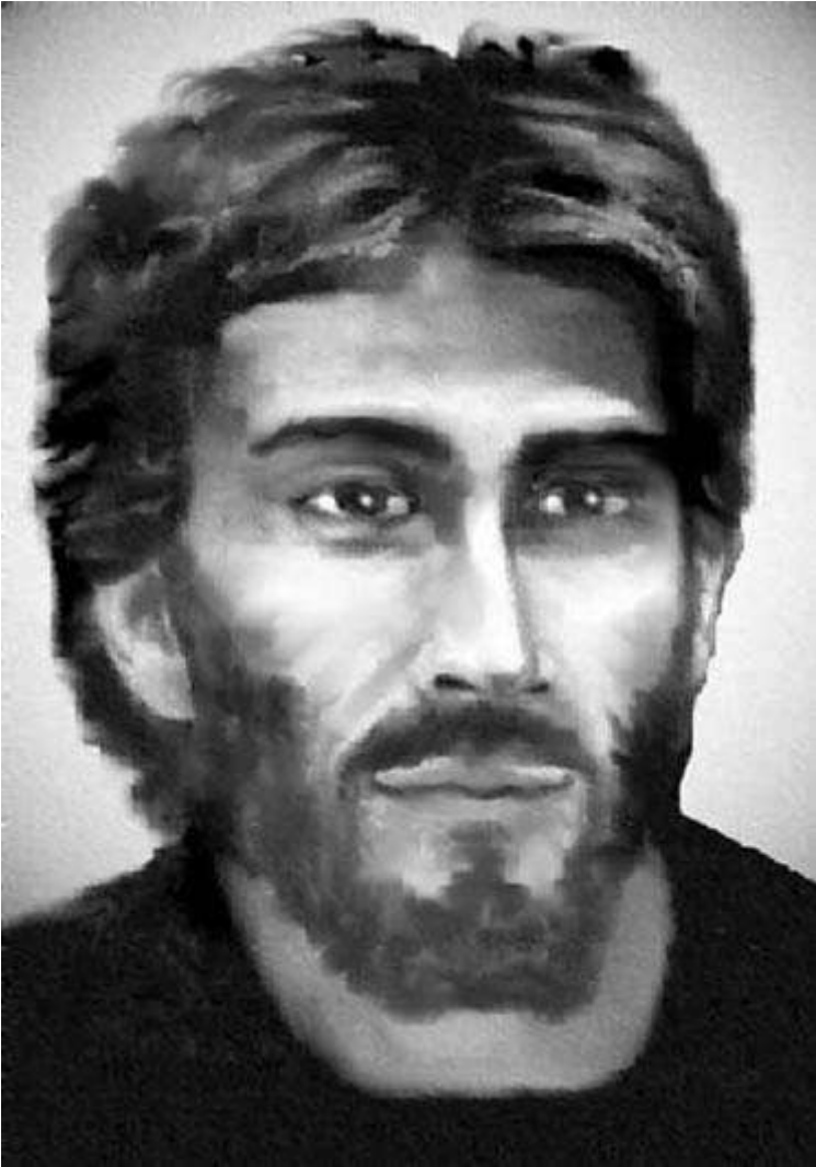
James the Apostle