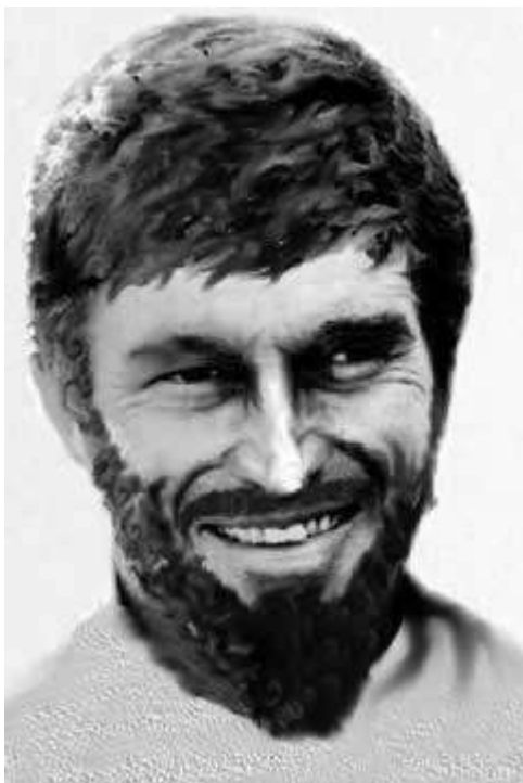
Nathanael the Apostle