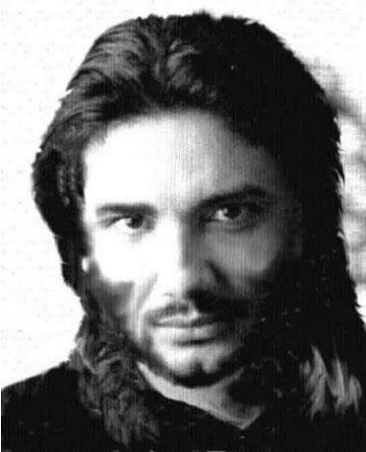
Simon the Zealot