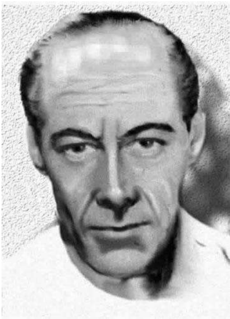
Publius Pontius Pilatus