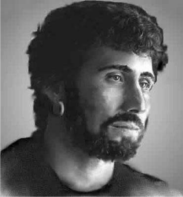
Matthew the Apostle